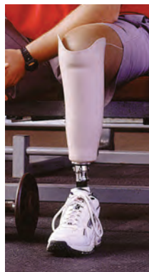
Transtibial PTB socket with locking pin suspension

A total contact socket enhances venous return, limits edema and reddening/inflammation on the distal end of the anatomic limb, and helps distribute the load somewhat.