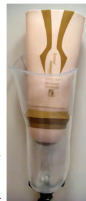
ICEROSS Seal-in transfemoral suction liner

Supracondylar suspension is accomplished by extended medial and lateral socket walls that fully encompass the femoral condyles and a compressible, contoured wedge that fits snugly above and against the medial condyle.